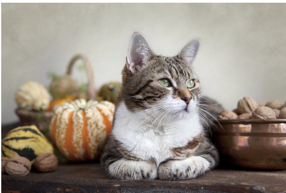
Help your cat enjoy the festivities with small amounts of turkey and vegetables.

If your kitty cat tops the list of things you are thankful for, you are not alone! Our furry friends give us warmth, love and laughs all year long. So it makes purrfect – sorry, couldn't help it! – sense if you want to include your cat in the Turkey Day festivities. Unfortunately, some of what we love most about Thanksgiving – the food, the friends, the family – can actually cause problems for our pets. Incorporate these tips for a day of feline-approved feasting and fun.