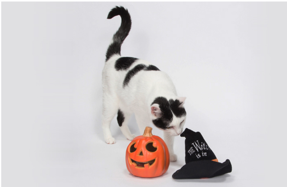
Keeping décor to a minimum and out of your cat's usual play areas will help keep him safe.

Cats reign as one of the most notable Halloween icons around. Black cats adorn Halloween décor from string lights to jack-o'-lantern cutouts, and we can't forget about all of the kitty costume inspiration flying around! What would we humans do without our cats, especially on this seemingly cat-obsessed holiday? Well, while we love our feline fanfare, there are a few tricks to watch out for when it comes to our pet's safety and Halloween.