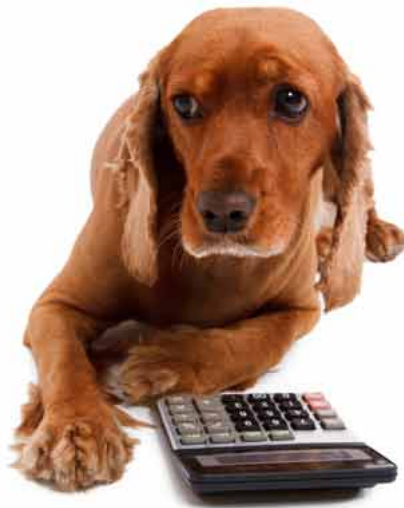
Calculating your dog's age may be harder than multiplying by seven.

Whether you have had your dog since he was a puppy or crossed paths when he was a bit older, like I did with my two dogs, you may wonder from time to time how old he actually feels. As each year comes and goes and birthdays celebrated with a juicy boneless steak and candle pass, your dog is indeed aging, but how quickly?