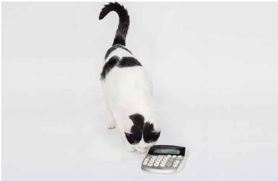
Find out how old your cat is in human years.

If you're crazy about your cat — or cats — we get it! Our pets make our lives better, and we'd do just about anything to ensure they live a long, healthy life. We may look into their furry faces and always see that little kitty who came home weighing only a few pounds, but they get older every year, just like we do. But, do they really? How do cats age in terms of human years and what can we do to keep them feeling as young as a spring kitten?