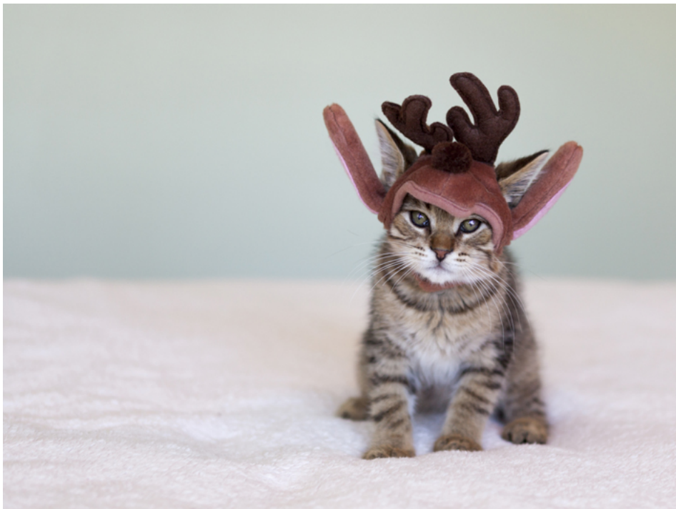
Holiday food and décor can be dangerous for cats.

Christmas is a time for celebrating with family and friends – and if you're like me, you consider your pet one of your nearest and dearest! After all, who else is always there for you day in and day out? Cats deserve to eat, drink and be merry this season, too, right? Well, maybe not like you think. While a little festive cheer may seem harmless, truth be told, a few of our holiday traditions can cause more harm than good.